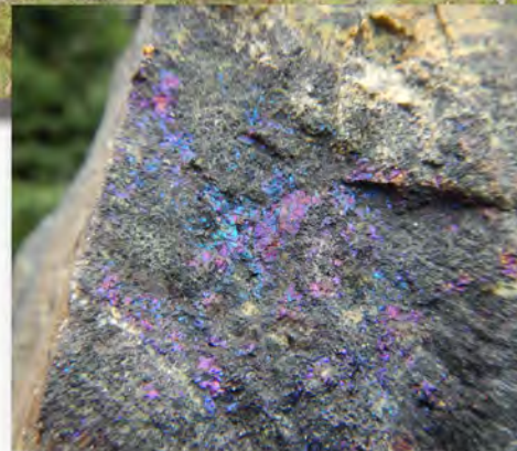
Area of "French Adit" where 175.0 meters of 0.27% copper was drilled.