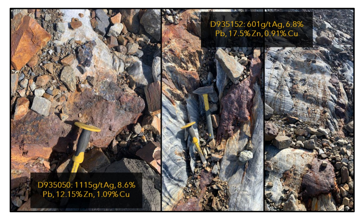
Figure 1: Photographs of high-grade massive and semi-massive carbonate replacement sulphide mineralization at the Gally CRD Target – Zone 2 (Core Assets, 2022).

Nick Rodway, President & CEO, commented: "The abundance of elevated surficial polymetallic discoveries at the Silver Lime Project continues to increase rapidly. The surface has barely been scratched at our district scale Blue Property, and our team is continuing to learn more about the geometry of the mineralized plumbing network and the limestone host rocks every day. We look forward to completing targeted drill testing at these new discoveries in 2023."